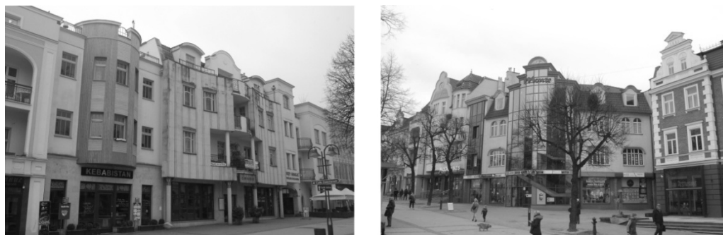
Figure 3. Examples of post-modernism buildings in the street frontage; the apartment building Three Graces (left) and the department store Monte (right)

Post-modernism, like historicism, is another architectural trend which derives from eclecticism. The main feature which distinguishes post-modernism from historicism is creative interpretation of historical models – interpretation, not imitation. Post-modernistic architecture is creative; while drawing from historical forms, its aim is to transform them in an original, modern way. Post-modernistic architecture and its unique character is connected with architectonic detail. The detail, which is the result of the artistic vision of an author, creates post-modernistic architecture – the architectonic form usually remains traditional. Despite the fact that post-modernism practically did not appear as a prevailing trend at the turn of the 20th century, buildings of different sizes, representing this trend, have been constructed in Sopot. In Bohaterow Monte Cassino street, which is the main pedestrian precinct in the representative part of the city, two buildings were constructed as infills in the existing street frontage. Both of them respect the scale of their surroundings (they relate to the scale and division proportions of a historic tenement house), and constitute examples of balanced post-modernism, with characteristic, original, post-modernistic detail. Today both buildings integrate well with the historic context of the city dating back to the turn of the 20th century (figure 3).