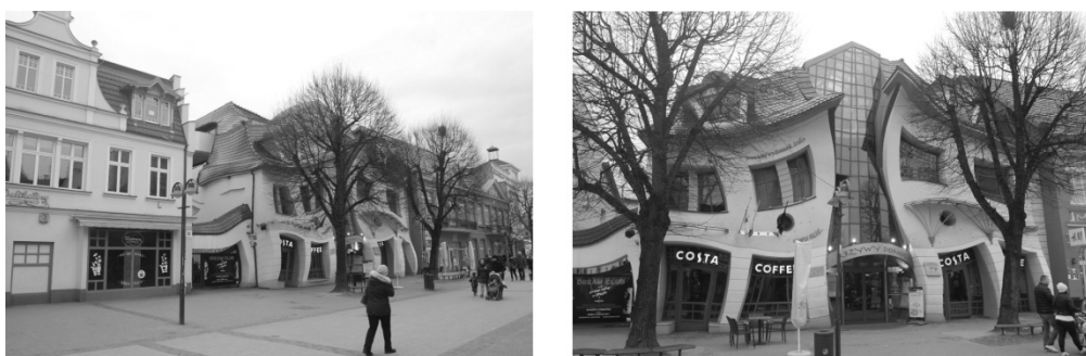
Figure 6. Today's architectural symbol of the city – an architectural joke, the so-called Crooked House in the street frontage

The so-called Crooked House is a characteristic building, constructed in 2004 and located in the frontage of Bohaterow Monte Cassino street - the main pedestrian precinct. The inspiration for this project were the works of a famous Polish artist – Jan Marcin Szancer, who was an illustrator of books for children [6]. Szancer's illustrations are magical, full of mystery and romanticism. The Crooked House does not possess any of these features – it is solely an architectural joke – despite the fact that it was constructed with the use of good-quality materials and has a certain charm. It should be located in an amusement park and not in the main street of a seaside spa with established identity, connected with the heritage of historic architecture from the turn of the 20th century. Like in the case of the Haffner Centre, the Crooked House may contribute to lowering the rank of Sopot – a cosy spa with unique character, which is currently being transformed into a popular, colourful and noisy place, similar to many others which can be found on the coast (figure 6).