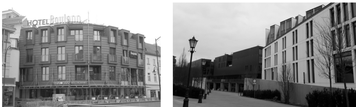
Figure 5. Contemporary architecture in Sopot; the Bayjonn hotel (left) and the new train station with the hotel building in the foreground (right)

Another important example of contemporary architecture in Sopot is the railway station complex, completed in 2016. It is the second important investment in the city (next to the Haffner Centre), which was realised with participation of the public-private partnership. In this case, as opposed to the Haffner Centre in Lower Sopot, the obtained result is not a failure. The architecture of the complex draws from the spirit of modernism; in the part located along the railway tracks it is modernism with industrial characteristics, while the part facing the city (the hotel building) loses its strong character and relates to new modernism. Strong, minimalistic form of the railway station building located next to the railway tracks, maintained in dark colours (the patinated copper siding of the façades) changes into a more gentle, sculptural, white form of the hotel near the exit to the city. The example of Sopot railway station shows that modern stylistics (differentiated depending on the context of its surroundings) may co-exist with historic architecture, neither trying to dominate it, nor constituting solely the background for it (figure 5).