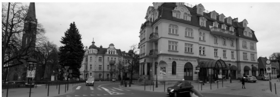
Figure 2. Historicising architecture of the Rezydent hotel (in the foreground) against the background of historic buildings dating back to the turn of the 20th century

Historicising architecture imitates historical forms, hence it is difficult to perceive it as fully creative and original. Its advantage is a high-quality design technique, translated in project realisation into good architectonic detail and good sense of scale, thanks to which a new building can exist in the historic context of its surroundings. Despite the fact that historicism continues the tradition of a given place, its greatest fault is lack of connection with the time when a building was constructed. A chance observer may find it difficult to differentiate between a historicising building and an original one (in this case a building dating back to the 19th century), and succumb to an illusion that they commune with a real thing – as may happen in the case of the Rezydent hotel in Sopot, despite the fact that its architecture, saturated with detail and wealth of form is, to a certain extent, an over-interpretation of historical forms (figure 2).