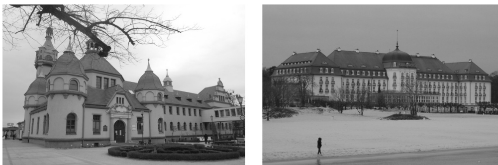
Figure 1. Historic architecture of the city, illustrated by public utility buildings: the balneological centre (left) and the Grand Hotel (right)

The identity of a city and its image is not always permanent and unchanging in time. In the case of Sopot, only 5% of the existing buildings were damaged during the Second World War. However, the most important ones, characteristic for the city and located in its representative part, i.e. in the so-called Lower Sopot, the district which stretches along the beach, were destroyed. The Spa House together with the casino, as well as the two representative hotels – the Metropol and the Wenninghof were burnt down. Sopot was a seaside spa and was visited by guests who, apart from taking baths and enjoying different treatments, were also gambling. The reputation of the casino went far beyond the city boundaries; there were stories about lost fortunes and suicides committed by the profligates in the depths of the Bay of Gdansk. Despite the war destruction, some of the public utilities, such as the balneological centre, the Grand Hotel and the pier, have survived in the seaside part of the city. All of them are still functioning today and constitute important landmarks in the city space (figure 1, 2).