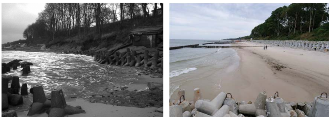
Figure 2. Repair and extension of the boundary band in Jarosławiec – as an adaptation to changes in sea level and weather conditions; state before and after intervention, [8].

It can be noticed then that interventions realized in recent years which were helpful to save the land, also brought in new spaces for recreation. They improved the conditions of spaces along the coast. Moreover, these interventions were the starting point for transforming adjacent areas. In analysed cases new compositions of pedestrian connections with water are being created. It can be seen that these interventions significantly change most of the areas visually and functionally cut off from the water. At the same time, they help to improve the quality of life.