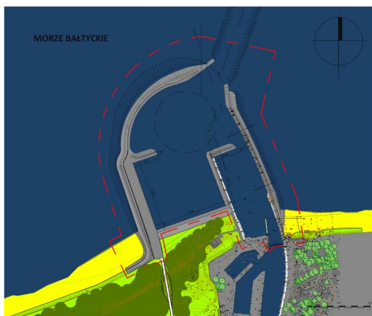
Figure 4. Ustka – the proposal to shape the elements of new port concept of new port /scheme of the designed construction as a part of public space network, [8].

The Ustka structure transformations projects show how important it is to create a safe coastal zone. This is also a model of hydro-technical forms, which ensures visual relationships with water. The presence of water is seen even from places not only located near its edge. It was possible to take full advantage of this zone by leading the main pedestrian path to the beach and by creating an overhead walking structure whose main role is to protect the city structure during storms.