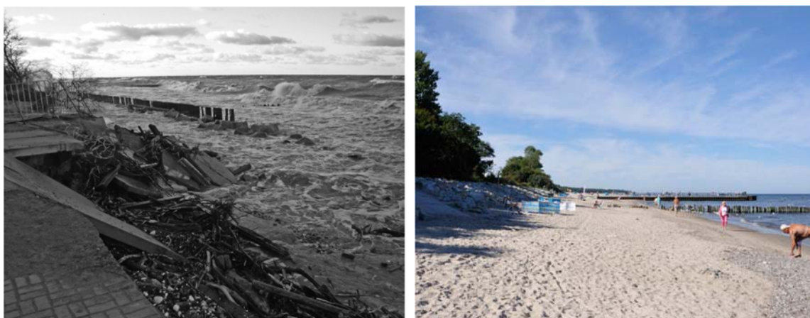
Figure 3. Kołobrzeg – underwater hydro-technical construction which allows to re-form the beach; state before and after intervention, [8].