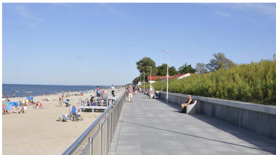
Figure 5. Coastal area in Sarbinowo – the transformation project of coastline strengthening by Adam Borodziuk, [8].

Moreover, due to the way of shaping the form of the coastline and its strengthening, all cases are examples where new development is planned which arises from the needs and the principles of sustainable development. One of the effects of this part of coastline transformation are elements created in the form of terraces falling towards the beach and water, always allowing access to the water. These elements are important points of the open space network. By maintaining the flexibility of the created system it can be adapted to unforeseen weather circumstances.