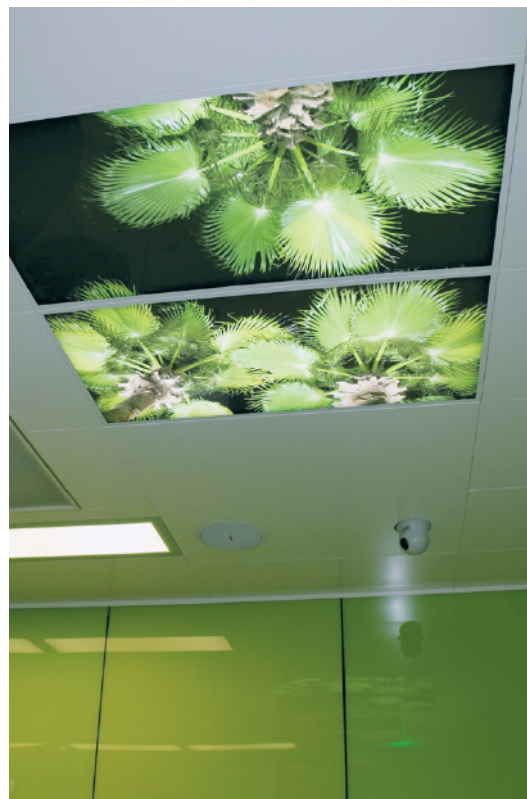
Figure 6. The ceiling art above hospital patient bed, 2016

use), non-porosity and the jointless connection. For the sake of its elasticity at forming shapes it is also used to make worktops and wash basins.