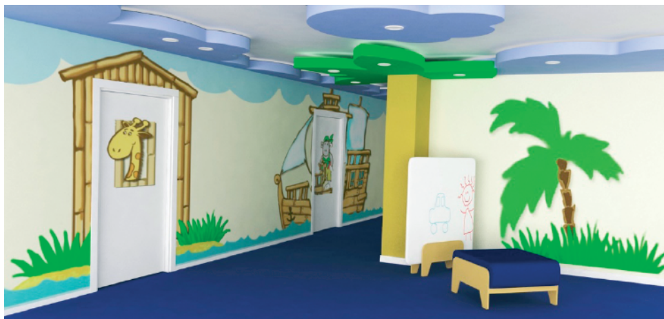
Figure 3. Bright colors and a jungle theme provide distractions for children during their visit in hospital – an example of interior design, authors: B. Misiejko and B. Konarzewska