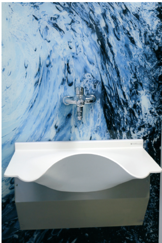
Figure 5. The glass wall with fixed graphics, 2016, Photography: A. Gębczyńska-Janowicz