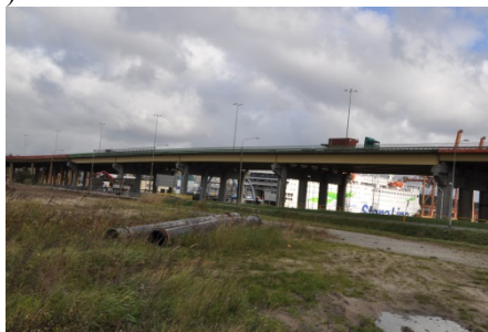
Fig. 3. View of: a) reserve of the Chylonki valley and b) Kwiatkowski Overpass.

Directions for the development of port areas for individual ports are largely intermingled. The revitalization of economically depleted port areas is associated with the need to develop new areas. In Polish ports, activities related to the revitalization strategy are currently being implemented to a large extent. Restructuring processes taking place in port areas in Poland are based on both the development of urban-port functions and other functions. Examples of activities in this area are the universalisation of the service offer or the reconversion of sites that serve a given type of cargo for other types of land. Some Polish ports had the opportunity to develop new areas through expansion. In this way, the area of the external port in Gdańsk was increased and the ferry base in Świnoujście was expanded. In these ports, new areas were also acquired by going out to sea, the DCT terminal in Gdańsk and the LNG terminal in Świnoujście. However, it is important that in most Polish ports the newly acquired areas were not located near the main port areas. Due to the ending of free space for the development of ports, the future directions of port development are mainly related to restructuring, but the acquisition of new areas for investment is most difficult in the Gdynia port, where the only possible action in the field of