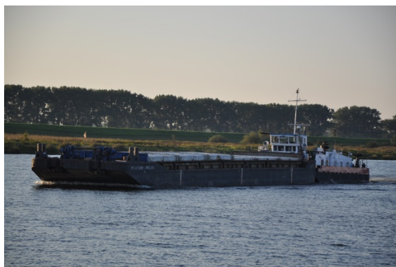
Fig. 1. Inland waterway transport by the Vistula River.

The lack of a direct inland connection between the Port of Gdynia and the Vistula delta is connected with significant difficulties in transporting cargo by inland navigation. In order to load goods, the inland waterway has to enter the Gulf of Gdansk, then to return to Gdynia port. Transshipment and shipping operations in the Gulf of Gdańsk are subject to restrictions due to hydro-meteorological conditions. This is due to the fact that inland vessels are not adapted to navigation and handling at high waves and strong winds. The above factors mean that for the transport of goods inland from the port of Gdynia, it is necessary to equip the unit with additional navigational and emergency devices and to train the crew in the same way as for a sea-going ship.