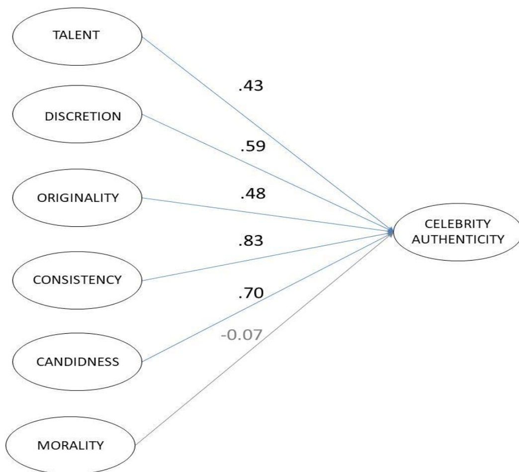
Figure 2: Structural model results

Notes for the model: Chi-square=509.537, df=127, Cmin/df=4.00 p < 0.001 , CFI=0.933 TLI=0.92 RMSEA=0.078 (0.071; 0.085), ML, standardized results