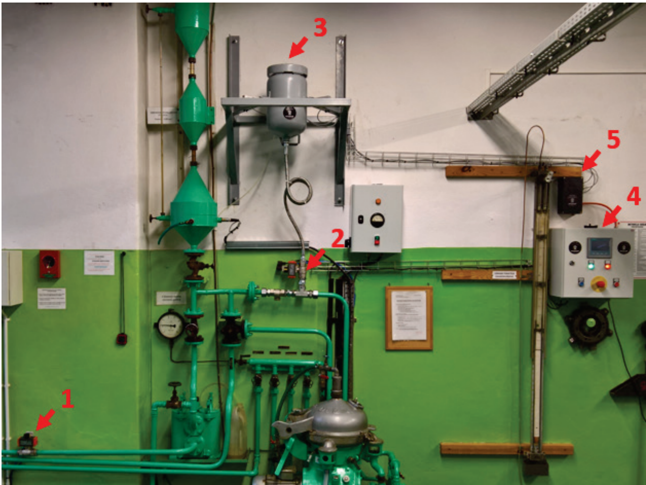
Fig. 1. Automated fuel consumption measurement system: 1 – main fuel tank cut-off valve, 2 – measurement tank cut-off valve, 3 – measurement tank, 4 – control cabinet, 5 – sensor connection box