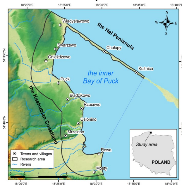
Figure 1. Research area.

which characteristic features are moderate winters and mild summers. The annual temperature is around 7.4°C and the average amount of precipitation does not exceed 700 mm. The income of local inhabitants comes mainly from agriculture, fishery and tourism, related to the seaside location and unique environmental values of this region.