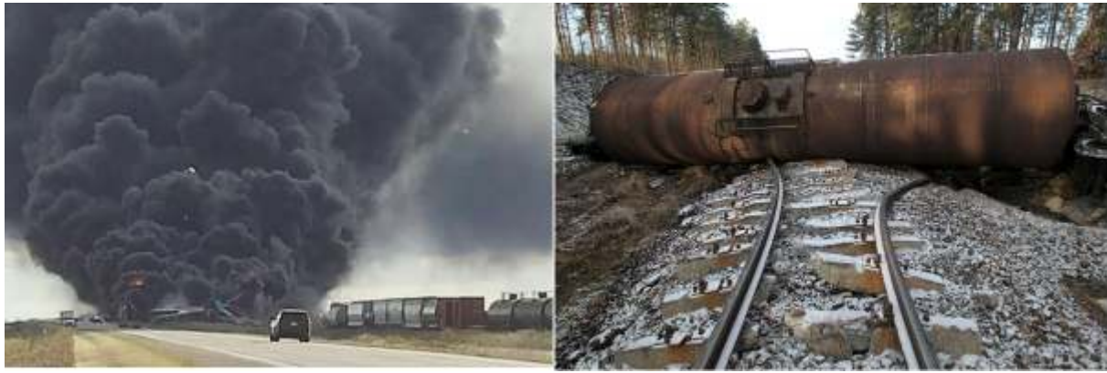
1. Railway disasters: a) in the Canadian province of Saskatchewan on 7/10/2014; b) in Wydmyny on 2 January 2016.