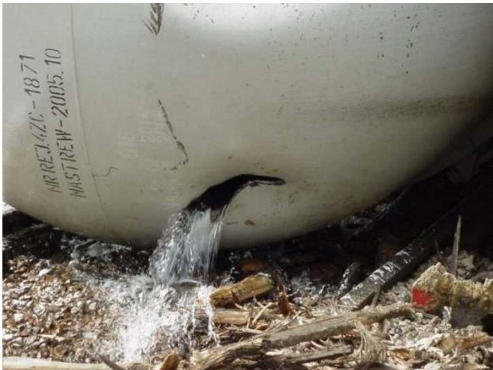
2. The negative impact of the railway disaster on the track. The catastrophe in Szczygłowie 05/23/2002 [10]

Collisions and derailments should also be looked at as follows: What if there were dangerous goods on the train?