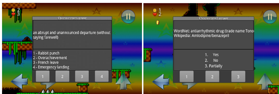
Fig. 3. TGame user interface (left: extended mappings, right: yes/no question)

mapping – if a majority of the players answer in accordance to the database, then we can consider the given mapping as correct. Otherwise, it needs looking into and manual correction.