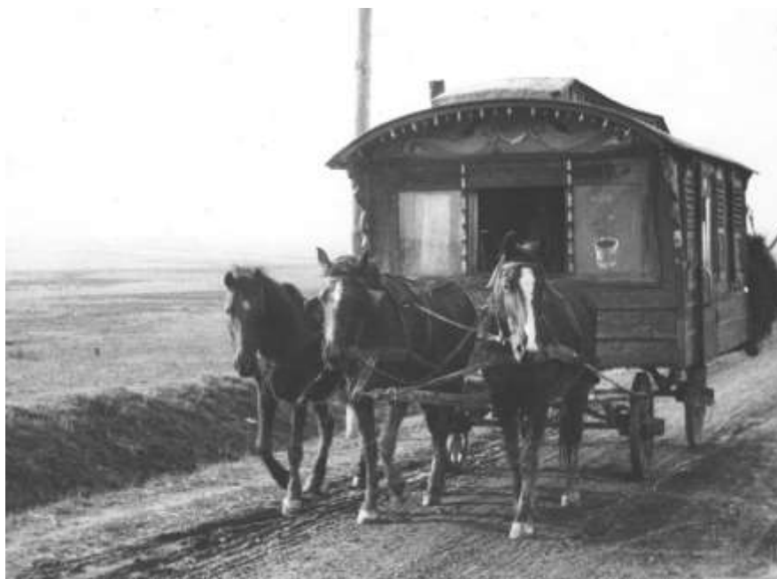
Fig. 1: Gypsy wagon dated about 1930

photographs were imported to the AutoCAD programme, which allowed the authors to build 3D models and establish the approximate dimensions and proportions of the photographed wagons and their details. Results confirmed that this method of digital restitution is reliable since the received dimensions were the same as the dimensions of the existing measured wagons; the differences were less than 5%. This allowed for preparing a hypothetical reconstruction drawing for one exemplary non-existent wagon illustrated in the archive photograph from the first decades of the twentieth century (Fig. 1).