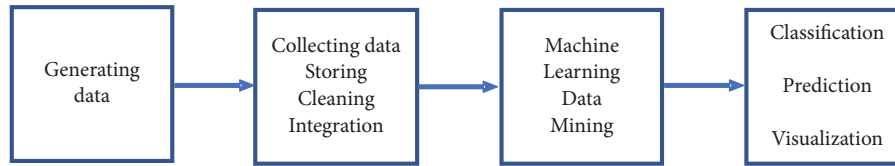
FIGURE 1: Procedure for the KDD.

convolutional neural networks to improve detection methods based on image processing through the application of filters. Their novel approach is able to recognise the boats through patterns regardless of where they are located. The proposed approach, which works in real-time, allows the detection of boats and people for search and rescue teams in order to plan for rescue operations before an emergency happens. The proposed method includes the use of essential cryptographic protocols for the protection of the highly sensitive information managed.