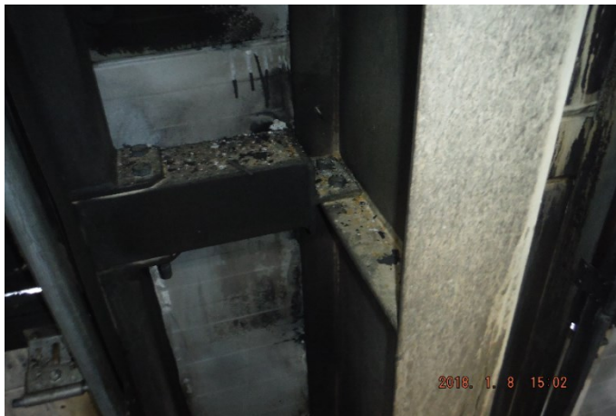
Fig. 4. Visible fire impact on steel construction elements.

Visual inspection shows that the insulated wall assembly with a sheet cladding and insulated membrane roofing on top of self-supporting sheets is partially damaged (see Fig.2) thus it should be removed and replaced. The main structural elements of I-section steel column and transoms (see Fig. 4) can be generally classified to the 1st category. However, small deformations of steel members were detected by visual observation, surfaces of selected structural members detect tightly adhering mill scales and surface erosion, denoting a high temperature exposure. In general, steel loses its mechanical properties in high temperatures (see e.g. [21]). Uniaxial tensile tests were further performed to assess specified post-fire parameters of I-section steel members.