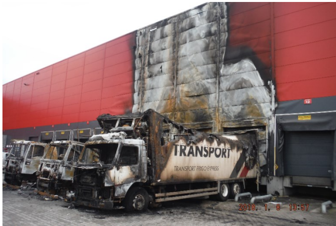
Fig. 1. View of fire damaged lorries and warehouse façade.

The research is bound to determine durability and strength of structural elements of warehouse buildings affected by fire conditions. The investigations partially contribute to the expert opinion on load-bearing capacity of structural elements, providing possibilities of safe load carrying by means of elements after fire events. The laboratory tests on steel specimens taken from fire-affected column were carried out in order to assess mechanical properties.