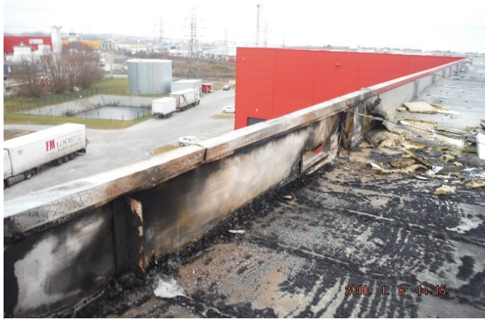
Fig. 2. View of fire damage to the roof elements.