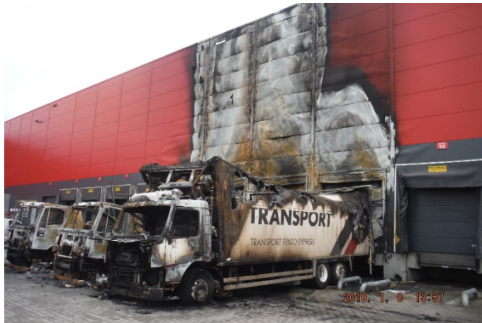
Fig. 1. View of fire damaged lorries and warehouse façade.

The research is bound to determine durability and strength of structural elements of warehouse buildings affected by fire conditions. The investigations partially contribute to the expert opinion on load-bearing capacity of structural elements, providing possibilities of safe load carrying by means of elements after fire events. The laboratory tests on steel specimens taken from fire-affected column were carried out in order to assess mechanical properties.