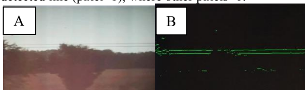
Fig. 6. Example of wire detection in the image, A – raw image from the camera, B – filtered image.

The gray scale pixels are used in EdgeExtractor (EE) . The EE module performs edge extraction (2) on a signal from R2G module. The resultant value generated by the EE is in the SM code ( sign-magnitude ). Further identification of the edge type is determined by the most significant bit (MSB). MSB=0 denotes positive and MSB=1 the negative edge. The result of the EE is used in the ER module for opposite parallel edges detection. The pixel position is the output from the module after edge reduction. Every obtained non-zero position gives detected line (pixel=1), where other pixels=0.