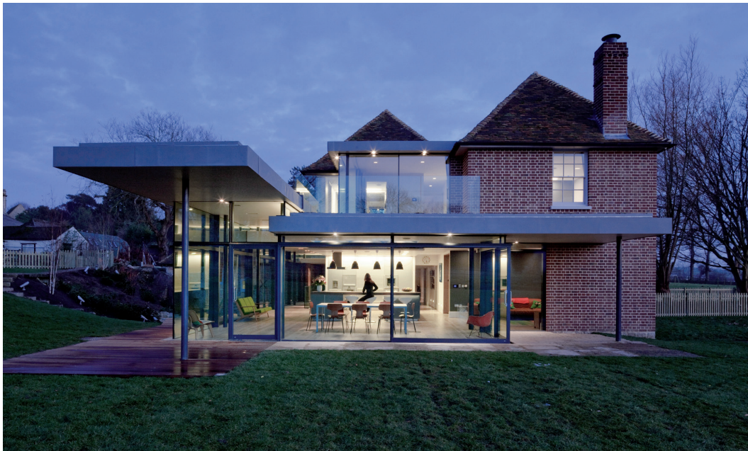
Figure 1 A crucial challenge facing lighting professionals today who design residential lighting schemes, is to provide LED lighting that is both visually safe and harmless to general health.