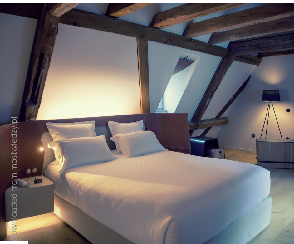
Figure 2 In the early evening, the rule for living room, kitchen and bedroom should be warm white lighting with a colour temperature below 3000K, containing as little blue light in the spectrum as possible.

During the day, we should aim to have natural light via windows and skylights and only supplement with artificial light where there is insufficient daylight available, for instance on gloomy overcast days, after sunset and during winter. In the early evening, the rule should be warm white lighting with a colour temperature below 3000K and it should contain as little blue light in the spectrum as possible. Ideally, at night, artificial lighting should be kept to a bare minimum with a recommendation of light with a spectrum greater than 600nm (amber, amber-red colour). All forms of this lighting at night should be indirect, preferably positioned at a low level, flicker-free and also