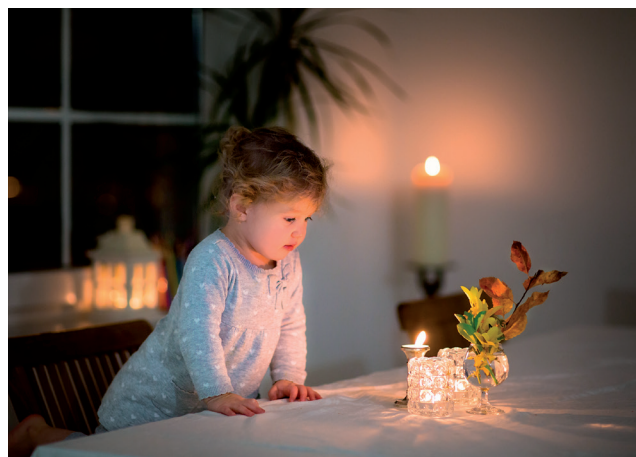
Figure 3 Even with all the latest lighting technology, dinner by candlelight cannot be matched. It creates an ambient atmosphere of warmth, beauty and magic.

My favourite light source for food illumination is still a simple wax candle, although I would recommend it only for special occasions. Even with all the latest lighting technology, dinner by candlelight cannot be matched for an ambient atmosphere of warmth, beauty and magic. Candlelight is very similar to the spectrum of sunset and