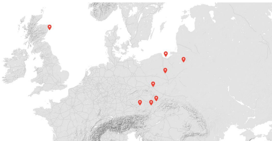
Fig. 1. Sampling points for the candidates for certified reference materials (Google Maps/Snazy Maps).