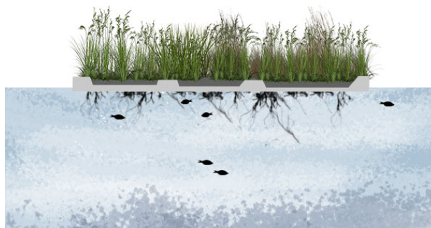
Figure 2: Floating raft of remediation plants.

To respond to these issues, students searched into the former lines of canals, moats, brooks and other water reservoirs, and then, creatively reinvented them, adjusting their forms to the actual urban, environmental and social context. The study was divided into several phases. In the first stage, students delved into water management and environmental engineering issues, recognising basic objectives, processes and infrastructures. In the second phase, they investigated historical maps of Gdansk and layered them against a contemporary map, analysing dynamic processes of relocation of urban waters. In the next phase, they searched for areas where referring to the historical waterways would be beneficial, taking into consideration the morphology of urban space; the possibility of implementing climate adaptation concepts; ecological potential and socio-cultural attributes of analysed areas. Subsequently, students identified territories where the recovery of historical waterways would be feasible and beneficial for the city. Then, they developed individual concepts referring to historical water contours, but proposing necessary changes and modifications to adjust the new layout to the existing city structure, social expectation, water management issues and ecological objectives (see Figure 1).