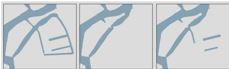
Figure 1: Changes in patterns of water: 1807, 2018 and students' proposal to restore canals as a stormwater reservoir and a blue-green core for new urban development (M. Płotka, K. Kosińska, D. Glugla, T. Sorgi).

water appeared and disappeared in a process of adjusting the city to the emerging military, economic and spatial needs. Several districts are located below sea level and thus are dependent on a continuous mechanical pumping action. In the past century, many streams and small rivers were covered in the underground drainage systems, causing significant spatial and ecological disturbances. Today, the massive withdrawal of industry from the city centre reveals amorphous and fragmented spaces where water may reappear. Within the integrated design studio, students worked on a question how this reappearance might not only influence characteristics of urban structure, but also enhance ecological attributes and the climate resilience of the city.