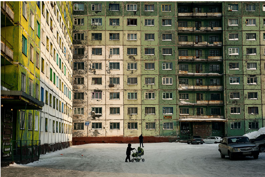
Figure. 2 In the city of Norilsk