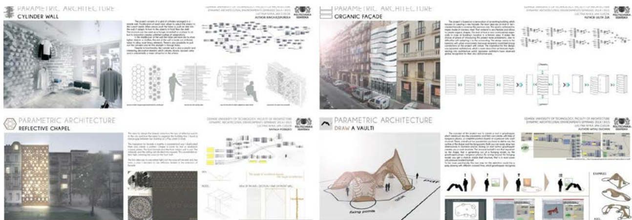
Figure 1: Adaptive spatial problem solutions created with parametric design by students taking the elective: Parametric Architecture in an Historical Context (Supervisor: J. Cudzik, FA-GUT).

The reviews stimulated discussion and led to changes in project proposals, thanks to the application of the easy-to-use algorithm-based tools (Figure 1). Students, in an anonymous survey, evaluated the results very highly, with an overall score of more than 4.6 on a scale of 1.0 to 5.0.