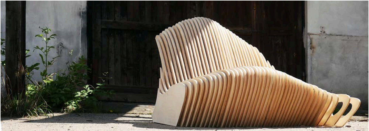
Figure 2: The digitally fabricated model of urban furniture created with parametric design at a 1:1 scale (Supervisor: J. Cudzik, FA-GUT).

The students had to learn the basics of parametric design, develop the final form from a possible mix of putative solutions, and then develop the entire fabrication process. The outcome of this short design studio was a bench with an additional bike rack that was inspired by the shape of a wave. After creating the first prototype, the students evaluated the proposed form, discussed what could have been done differently, and then incorporated conclusive remarks into the software script with which the final form was created (Figure 2).