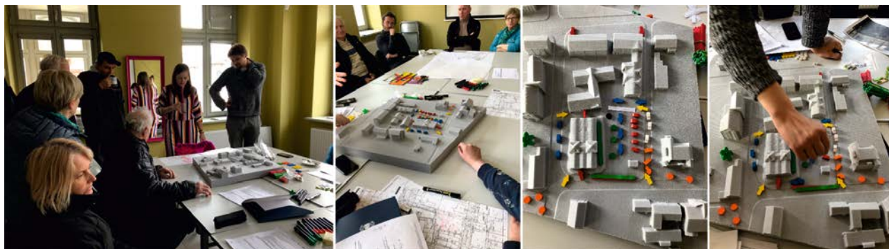
Figure 2: Professional participatory workshops in physical design, GOSPOSTRATEG project, April 2019 (Photographs by J. Borucka).