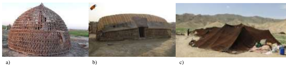
Fig. 2a: Kapar of Kerman province, Fig. 2b: Kapar of Sistan and Baluchestan province, Fig. 2c: Kapar of Khorasan province Source: a) www.halil.ir ; b) http://zahedan.irib.ir/ ; c) https://www.borna.news

Tents can also be found in the eastern and southeastern parts of the country, which includes parts of Khorasan, Sistan and Baluchestan, and Kerman and Hormozgan provinces (Fig.2a, Fig.2b, Fig.2c). Here special weather conditions prevail. In this area, climate diversity is severe, and in general, this region has low water levels and low rainfall with hot weather and a great difference in temperature overnight. Kapar is one such hut made in the southern part of Kerman province. Usually, huts in Kerman have a circular shape and in the Sistan and Baluchestan provinces the hut (kabar) has an ellipsoidal shape with a lower ceiling.