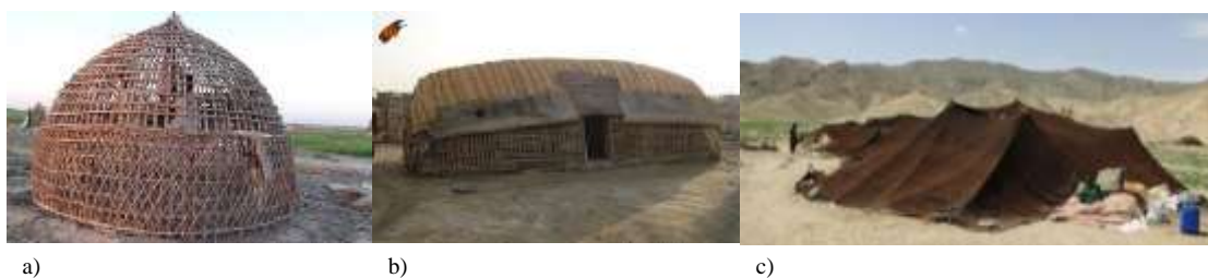
Fig. 2a: Kapar of Kerman province, Fig. 2b: Kapar of Sistan and Baluchestan province, Fig. 2c: Kapar of Khorasan province

Tents can also be found in the eastern and southeastern parts of the country, which includes parts of Khorasan, Sistan and Baluchestan, and Kerman and Hormozgan provinces (Fig.2a, Fig.2b, Fig.2c). Here special weather conditions prevail. In this area, climate diversity is severe, and in general, this region has low water levels and low rainfall with hot weather and a great difference in temperature overnight. Kapar is one such hut made in the southern part of Kerman province. Usually, huts in Kerman have a circular shape and in the Sistan and Baluchestan provinces the hut (kabar) has an ellipsoidal shape with a lower ceiling.