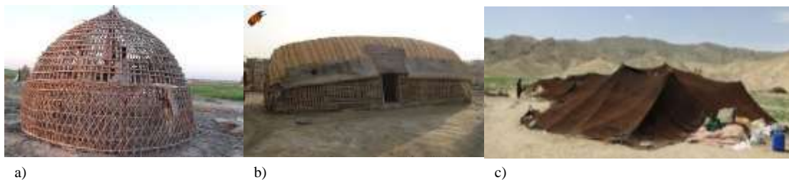
Fig. 2a: Kapar of Kerman province, Fig. 2b: Kapar of Sistan and Baluchestan province, Fig. 2c: Kapar of Khorasan province

Tents can also be found in the eastern and southeastern parts of the country, which includes parts of Khorasan, Sistan and Baluchestan, and Kerman and Hormozgan provinces (Fig.2a, Fig.2b, Fig.2c). Here special weather conditions prevail. In this area, climate diversity is severe, and in general, this region has low water levels and low rainfall with hot weather and a great difference in temperature overnight. Kapar is one such hut made in the southern part of Kerman province. Usually, huts in Kerman have a circular shape and in the Sistan and Baluchestan provinces the hut (kabar) has an ellipsoidal shape with a lower ceiling.