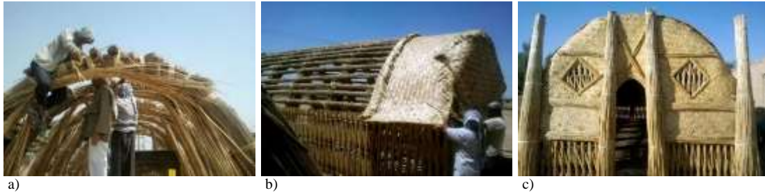
Fig. 10a, 10b, 10c: Construction processes of Mazif