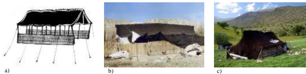
Fig. 1a, 1b: Black Tent of Ilam province; Fig. 1c.: Black Tent of Chaharmahal and Bakhtiari province

The Black Tent and typical nomad housing can be found in the Zagros Mountains (Fig.1a, Fig.1b, Fig.1c). The Zagros Mountains are located in the western and southern part of Iran in the provinces of Ilam, Kermanshah, Kurdistan of Kohkiluyeh and Boyerahmad, Chaharmahal and Bakhtiari, Esfahan and Fars.