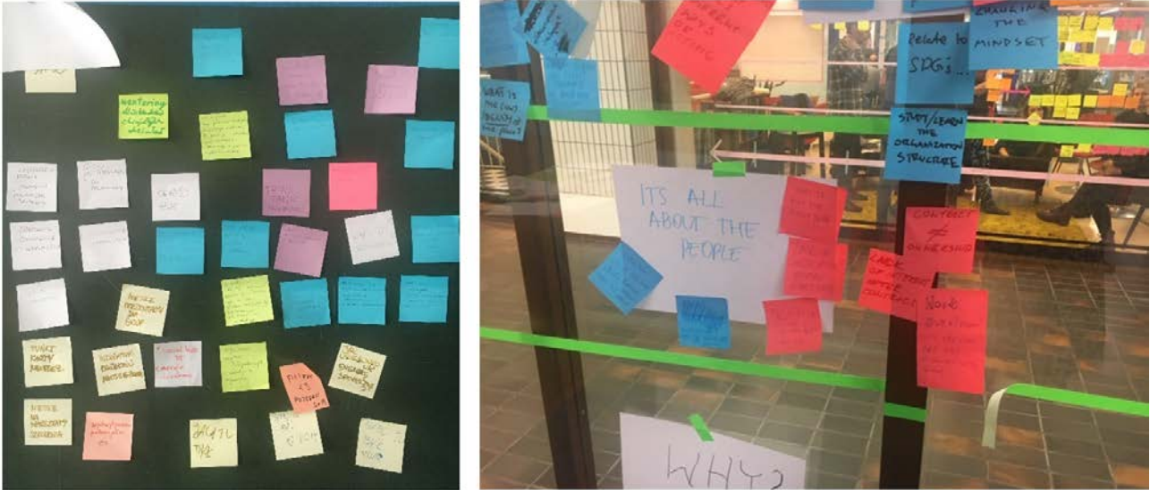
Figure 1: Identification of users' needs - empathy phase (Source: Authors).

These principles are mapped by the five steps of the DT process as outlined by the Stanford d.school, which are empathy - define - ideate - prototype - test [5].