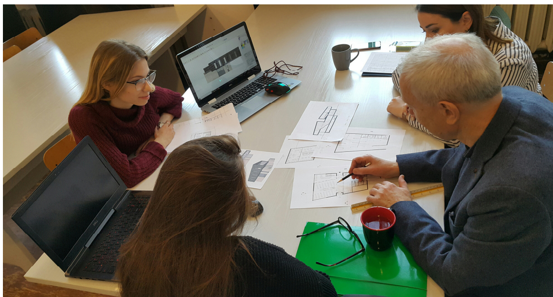
Fig. 3. The designing class at the Architecture Faculty of Technical Gdansk University supervised by the professor of architecture supported by the civil engineer tutor.

Optimization of the academic teacher profession while striving to improve the level of specialization in architectural education affects the qualification requirements of persons providing education at European architecture schools in Master's degree education courses. There is a tendency to divide classes into groups in which classes can be conducted only by carefully selected supervisors - 'masters' alike. Education aimed to achieve high-level education effects in groups focused on design is expected to be conducted by tutors with significant contributions to the development of the scientific discipline - architecture and urban planning, building qualifications in the architectural specialty and professional experience acquired in design practice. Supervising in the designing classes group may also be conducted in cooperation with other tutors having professional experience adequate to the scope of the activities. Alike in the case of persons entitled to supervise masters diplomas in architectural education, a project elaborated through a master-apprentice formula, supervisors are expected to have - in addition to significant scientific achievements constituting an essential contribution to the development of a given scientific discipline - building qualifications in the architectural specialty and professional experience acquired in design and construction activities as well as significant project achievements.