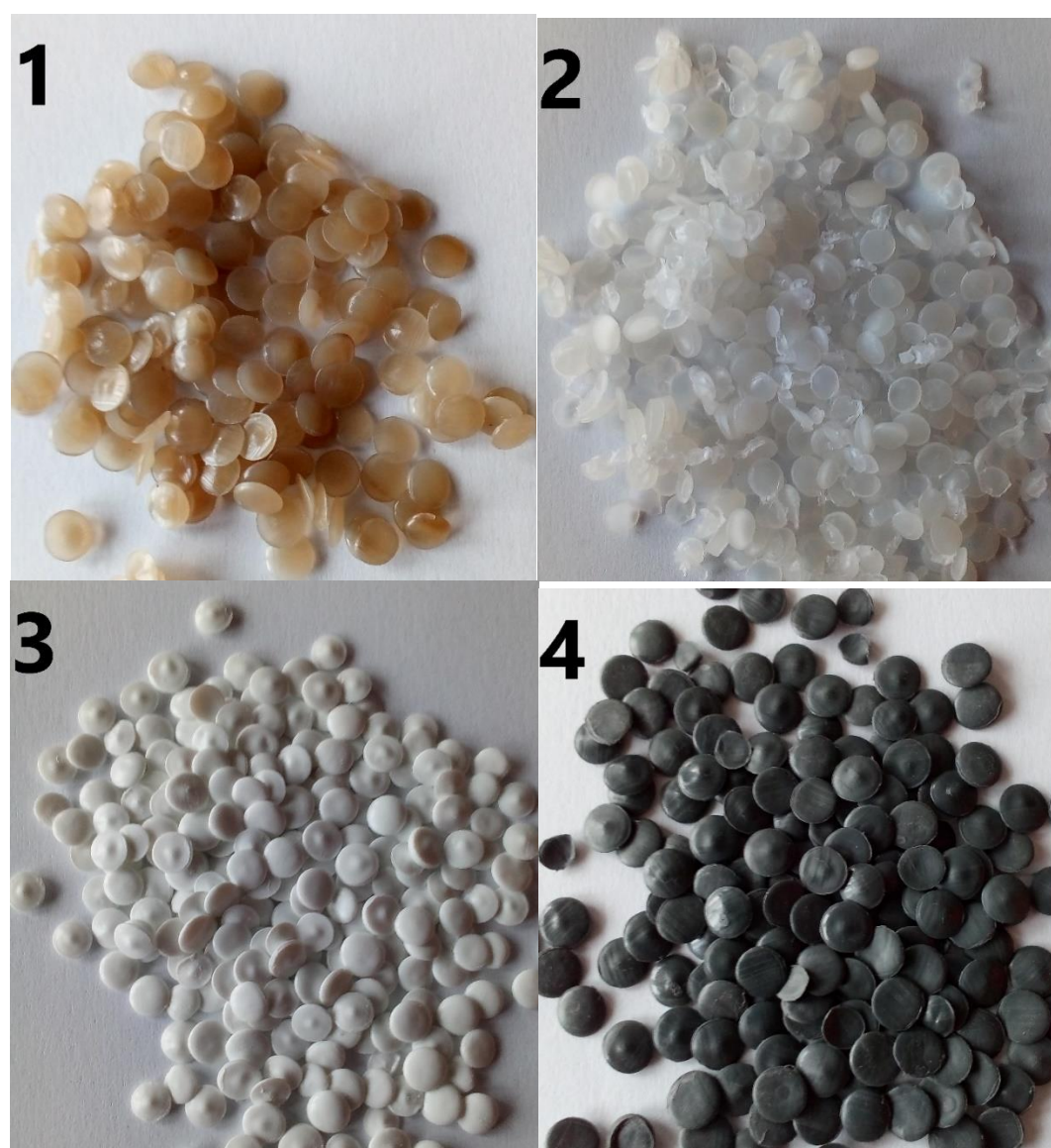
Figure 1. The appearance of analyzed recycled LDPE streams.

investigated and described in the literature. It should be, without any doubt, analyzed during the application of recycled and waste materials, which could be contaminated and partially decomposed as a result of consumer use. Such an effect may noticeably affect the environmental impacts of various materials, e.g., recycled plastics. Therefore, in the presented work, we aimed to assess the VOCs emissions from the recycled low-density polyethylene (LDPE) streams.