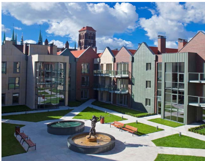
Figure 4: Architecture that can be perceived with all the senses - a housing complex in Gdańsk (Source: FORT Tarasziewicz Architekci Sp. z o.o. in Gdańsk).

Rasmussen writes about experiencing architecture through such elements as: solid shapes and emptiness, contrasts, colour planes, scale, proportions, rhythm, texture, light or even of hearing architecture [4]. This holistic approach to experiencing architecture with all the senses allows contemporary man to open up to various impressions, and through their perception to reveal his true, individual psychological needs and his true essence. Architecture is my space and, emotionally, only mine (Figure 4).