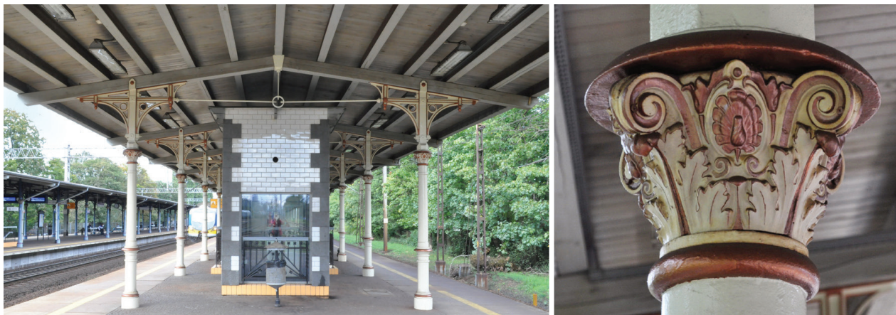
Fig. 5. Sopot railway station, general view and construction detail of the 19 th -century cast-iron platform shelter on the platform of the SKM (Rapid Urban Railway), 2020

Il. 5. Sopot, dworzec PKP, widok ogólny i detal konstrukcji XIX-wiecznej żeliwnej wiaty peronowej na peronie Szybkiej Kolei Miejskiej, stan z 2020 r.