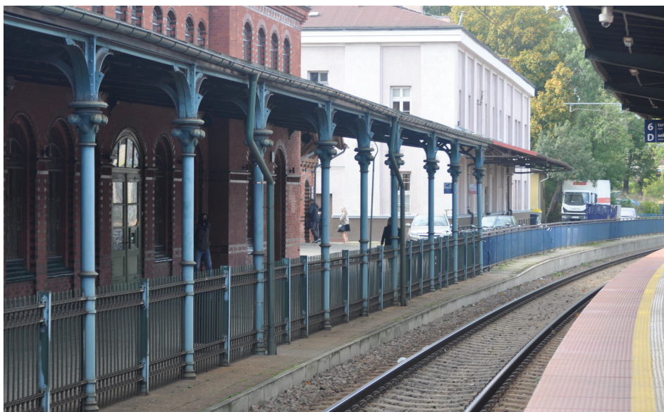
Fig. 7. Malbork railway station, single-pitched platform shelter with cast-iron pillars, the state in 2020

Il. 6. Sopot, dworzec PKP, widok ogólny i detal konstrukcji wiaty peronowej na peronie dalekobieżnym zrealizowany około 2011 r., stan z 2020 r.