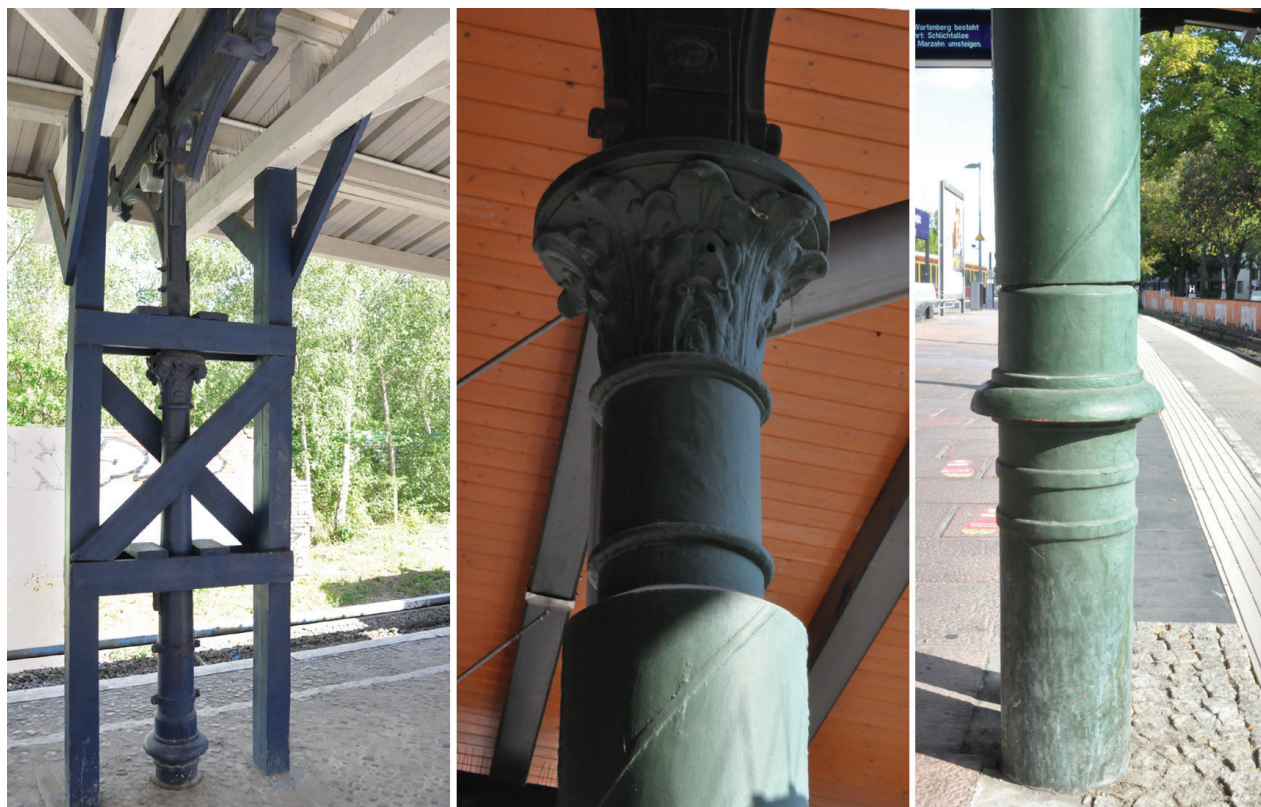
Fig. 9. Berlin, examples of repair work on cast-iron columns of platform shelters in S-Bahn stations, the state in 2019

Il. 9. Berlin, przykłady prac naprawczych żeliwnych słupów wiat peronowych na stacjach S-Bahn, stan z 2019 r.