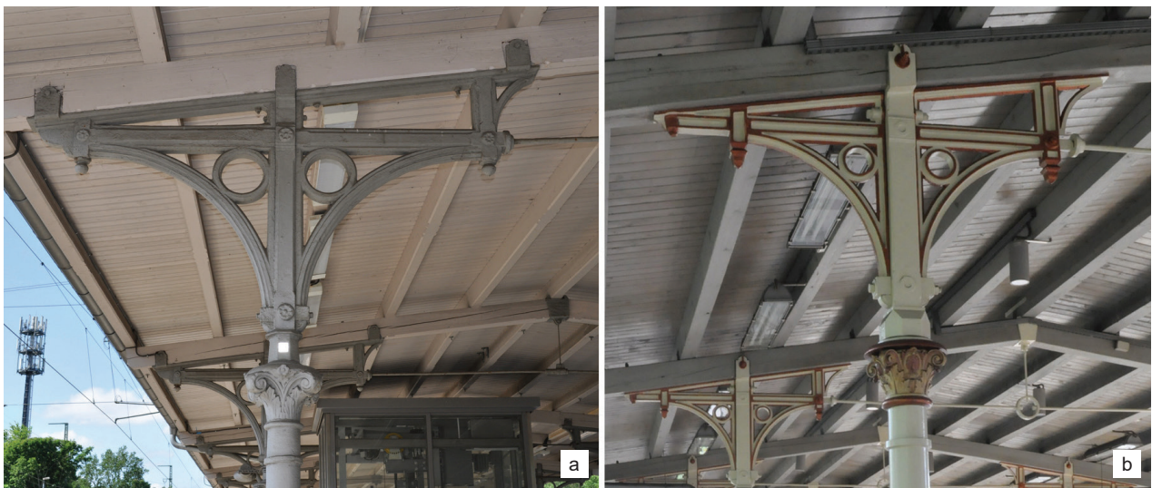
Fig. 4. Comparison of the upper parts of cast-iron columns supporting platform shelters: a) Berlin S Wannsee Bahnhof, 2019, b) Sopot, 2020

Il. 3. Gdańsk Główny, dworzec PKP, prace przy ponownym montażu odnowionych żeliwnych słupów zadaszania peronu 2, stan z 2018 r.