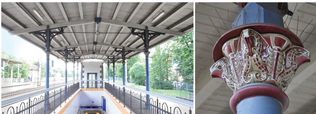
Fig. 6. Sopot railway station, general view and construction detail of the platform shelter on the long-distance platform created about 2011, the state in 2020

Il. 5. Sopot, dworzec PKP, widok ogólny i detal konstrukcji XIX-wiecznej żeliwnej wiaty peronowej na peronie Szybkiej Kolei Miejskiej, stan z 2020 r.