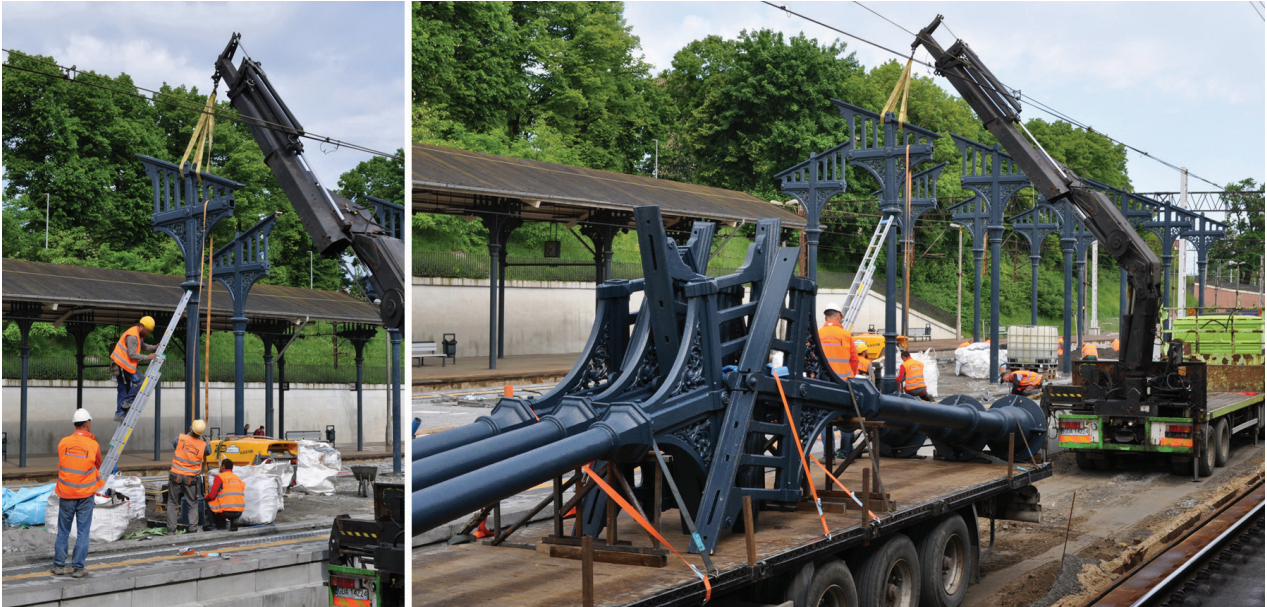
Fig. 3. Gdańsk Główny railway station, works of reassembly of the renovated cast-iron pillars of platform No. 2, 2018

Il. 3. Gdańsk Główny, dworzec PKP, prace przy ponownym montażu odnowionych żeliwnych słupów zadaszania peronu 2, stan z 2018 r.