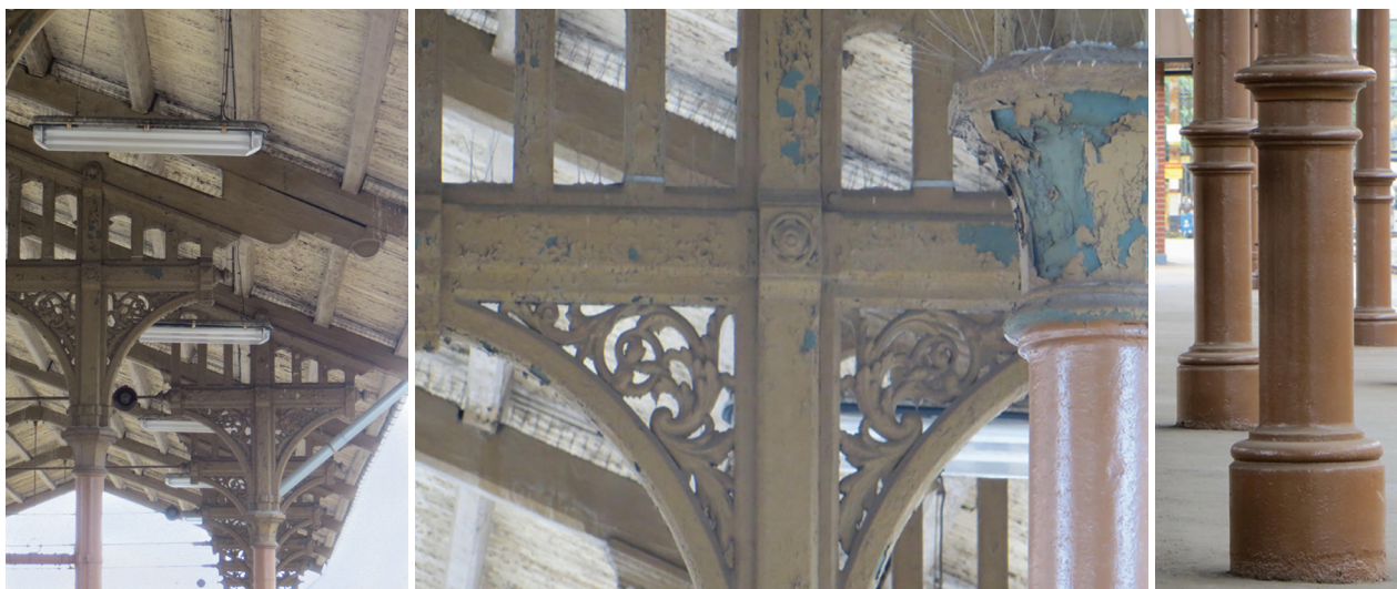
Fig. 2. Gdańsk Główny railway station, platform No. 2 roofing, 2012

Il. 2. Gdańsk Główny, dworzec PKP, zadaszenie peronu 2, stan z 2012 r.