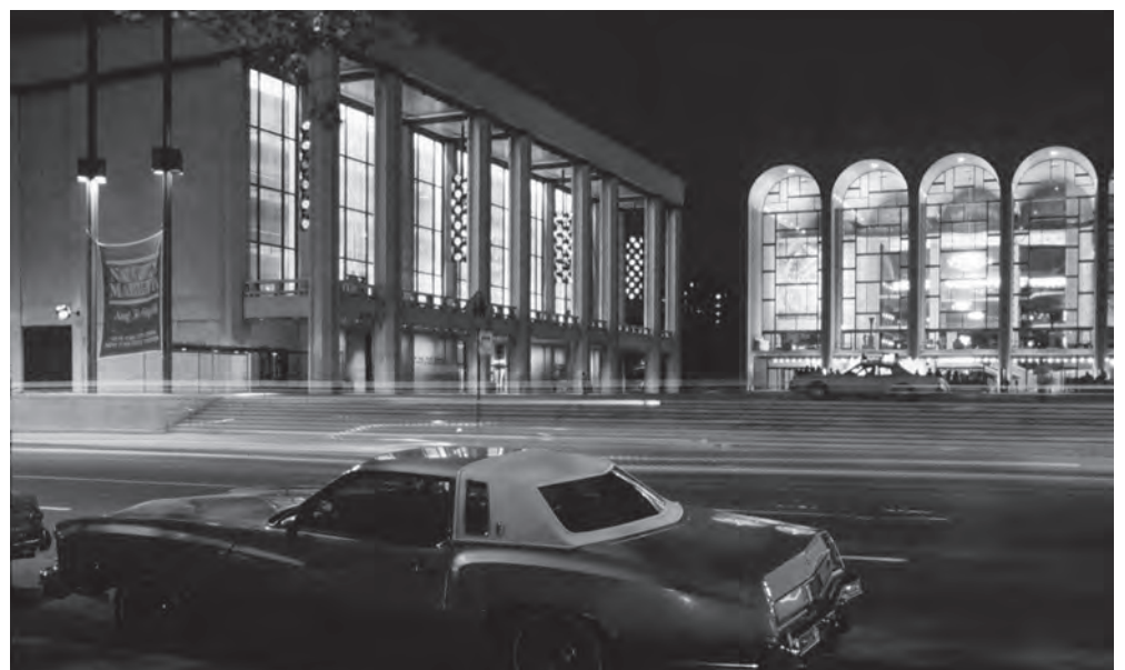
Figure 5 The New York State Theatre and Plaza with external and internal illumination designed by Richard Kelly.