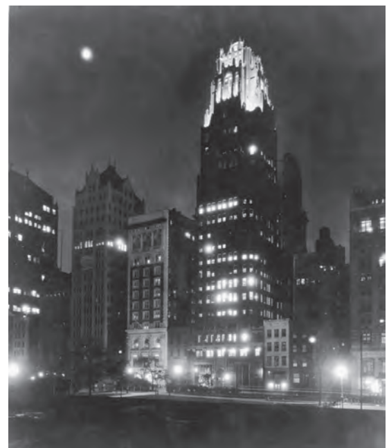
Figure 3 The American Radiator Building illuminated by Bassett Jones, as it appears at night, New York, in mid 1930s. The tower was specially designed in black brick and gold plating to have its color scheme reversed under nocturnal illumination.

As a result of many activities undertaken in the 1920s and 30s, there was an unexpected change in the attitude of architects. This