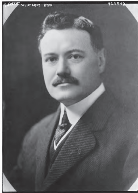
Figure 2 Walter D'Arcy Ryan director of the Illuminating Engineering Laboratory at General Electric and pioneers of the newly emerging movement.

“He has no conception of the effects desired. He has no creative ability, no knowledge of the history of architecture and history of ornamentation, and in fact, he is working in the dark absolutely.”