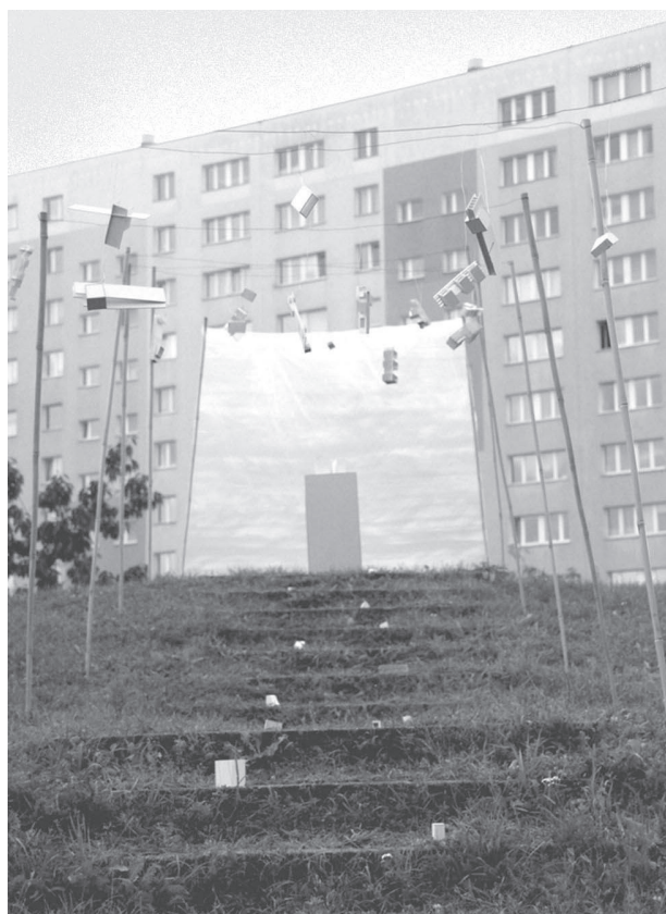
Fig. 1. Intentional project entitled "Unrealization", Outdoor Festival "Pictures Painted with Fire", Gdański Archipelag Kultury [Gdańsk Archipelago of Culture], Gdańsk-Zaspą, October 2015 (author: A. Kurkowska)

The architectural spatial structure is based on the uniqueness of a spatial situation. The attitude of intentionality adopted by me to accompany the participants of the event, assumed the activity of the recipient's mind in re-