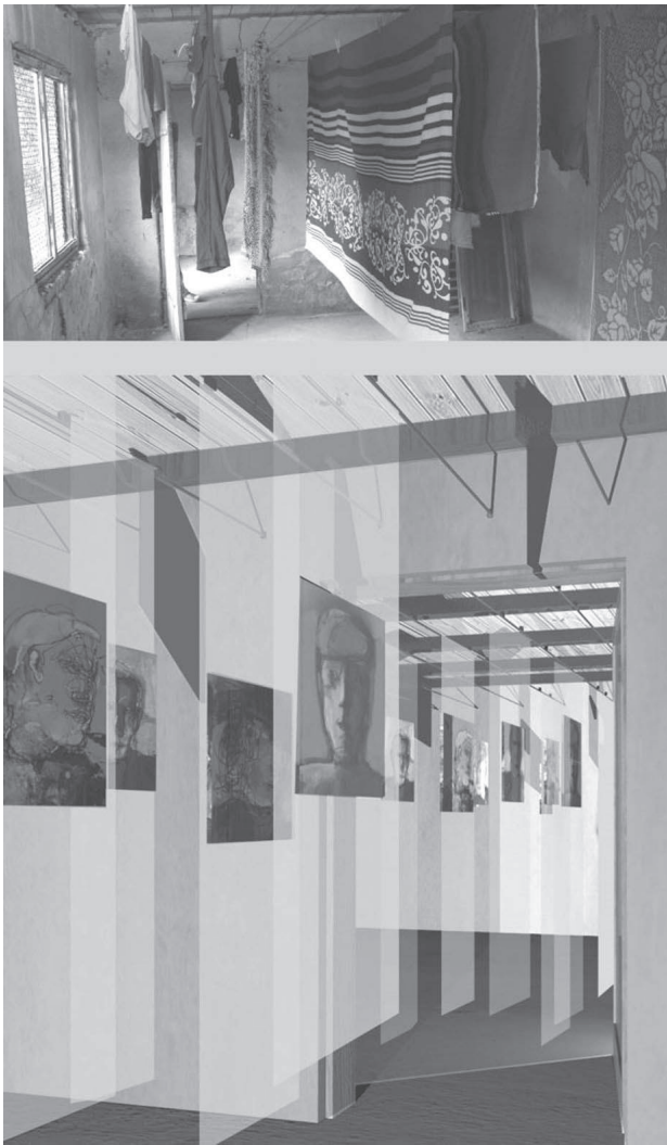
Fig. 3. The existing drying room in Nowy Port and the concept of an intentional spatial structure project entitled “Niepokój wizytujących nieznajomych”, Gdańsk-Nowy Port 2015

(design: A. Kurkowska, M. Kaus, photo and visualization by M. Kaus)