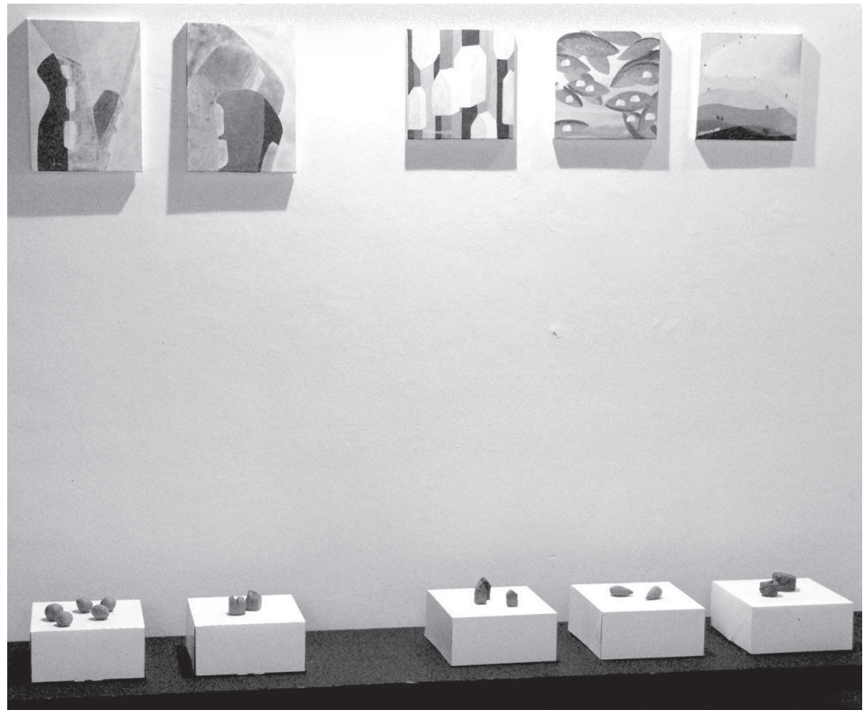
Fig. 4. Selected paintings and sculptures, exhibition "Kaszubskie zamieszkiwanie. Studium", PLAMA Gdański Archipelag Kultury, Gdańsk-Zaspa (author: A. Kurkowska)

Il. 4. Wybrane obrazy i rzeźby na wystawie pt. "Kaszubskie zamieszkiwanie. Studium", PLAMA Gdański Archipelag Kultury, Gdańsk-Zaspa (autor: A. Kurkowska)