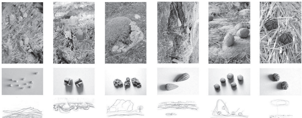
Fig. 5. Selected sketches and photos from the placement of sculptures in the Kashubian natural realities, exhibition entitled "Kaszubskie zamieszkiwanie. Studium" Gdański Archipelag Kultury PLAMA, Gdańsk-Zaspa (author: A. Kurkowska)

The most obvious archetypes concerning the formation of living space that function in culture relate to the refuge.