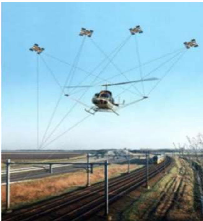
Fig.2. Using helicopter equipped with a scanning laser

Often, archived power line plans are incomplete and not accurate, and therefore need updating. This involves field inspections, which slows down the inventory procedures. To prevent this, auxiliary tools are used that significantly accelerate the tedious inventory. For example the FLI-MAP system is such a tool, which simplifies and accelerates the creation of GIS systems[22]. FLI-MAP (Fast Laser Imaging and Mapping Airborne Platform) consists of a helicopter equipped with a scanning laser that can measure a length of over 225 km per day (Fig. 2), because flying at an altitude of (20-225) meters at a speed of (40 – 80) km/h the system locates an average of (10 – 20) points per m 2 . This high point density ratio allows one to determine the exact and reliable position and height of devices, substations, columns and other objects in the scanned corridor. Besides, it is possible to detect cable overhangs, the technical condition of existing lines or to search the area for new lines [22].