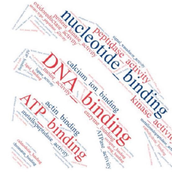
Figure 2. Ontology terms highlighted in word cloud application ( https://www.wordclouds.com/ ) for all significant ( p < 0.1 ) results obtained from agriGO search.