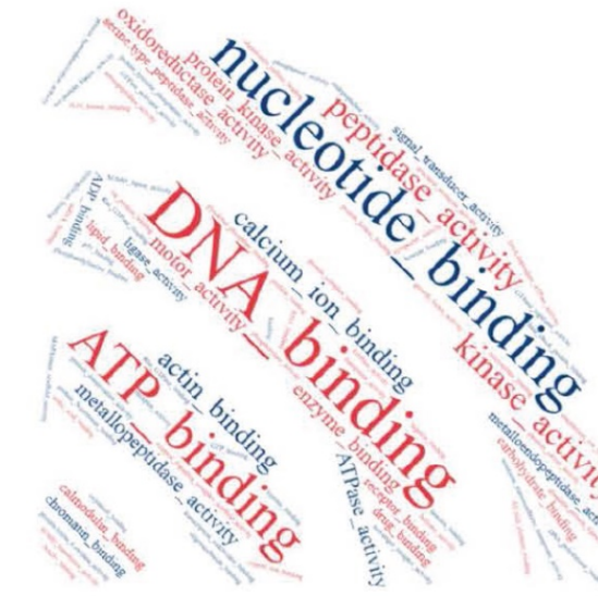
Figure 2. Ontology terms highlighted in word cloud application ( https://www.wordclouds.com/ ) for all significant ( p < 0.1 ) results obtained from agriGO search.