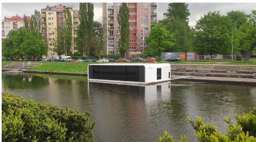
Figure 4. Floating house located in the center of Gdańsk, Poland [18]