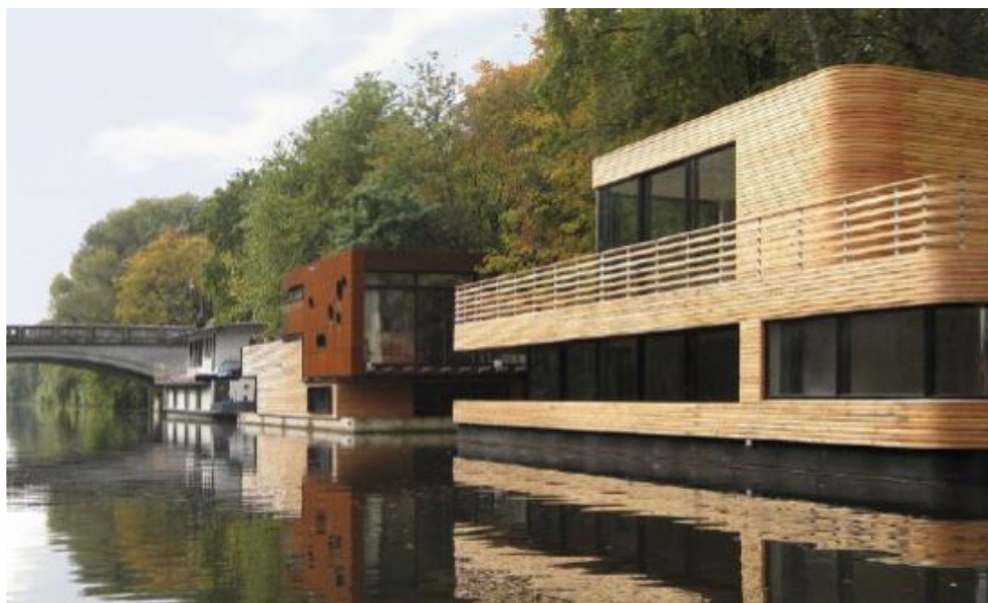
Figure 3. Floating House in Eibekkanaal, Hamurg, Germany [17]