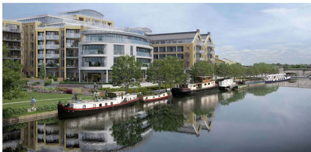
Figure 2. Narrowboats moored next to Kew Bridge in London [1]

The State of the Surroundings Scenarios (SSS) evaluate the impact strength of individual processes (factors) on the research subject. The knowledge of the scenario creators and consultants are the basis of the evaluations.