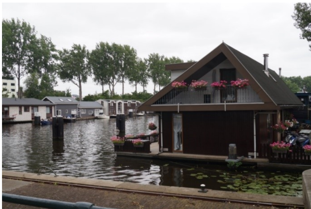
Figure 1. Estate of floating homes in Amsterdam [16]