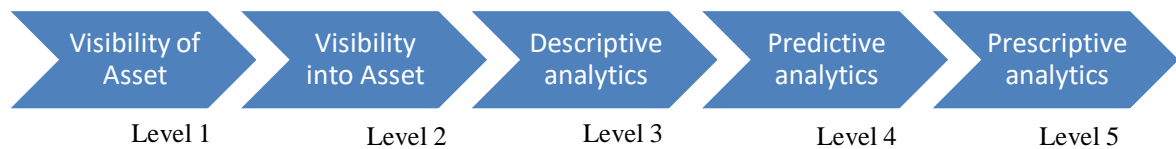
Figure 1: Levels for Total Productive Maintenance

As shown in figure 1, level 1 and level 2 are preparatory levels and generally deal with what the asset is made of up and what are the current values of monitored variables? Descriptive analytics answers the current condition and situation of the machine. Predictive analytics forecasts when a particular event will occur. And finally, prescriptive analytics proposes what decisions/remedial actions should be taken when the event occurs.