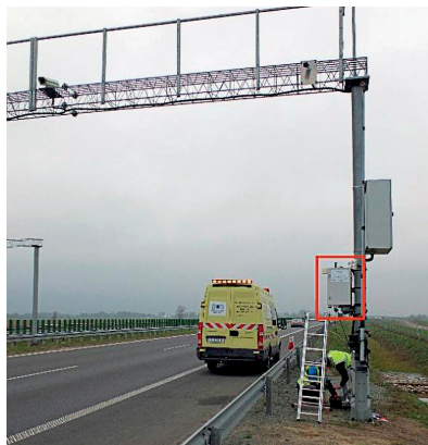
Fig. 30.1. Measuring station (marked with a red rectangle) mounted on the gantry pillar

Tests on the S7 road were aimed at verifying the operation of the sensors in real measurement conditions. The measuring station was mounted on a gantry pillar (Fig. 30.1) at a height of approx. 250 cm from the ground (the sensor was installed 40 cm from the bottom edge of the station). The distance from the edge of the right lane was about 420 cm.