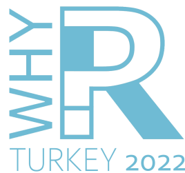
Figure 1: The logo of Why R? Turkey 2022 Conference

Participation certificates for attendees, speakers, workshop tutors and panelists were prepared