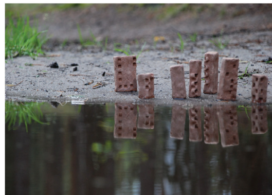
Fig. 3. Selected activities as part of the author's project entitled "Kashubian residence. In search for bionic relations". Sets of repeating elements (elaborated by A. Kurkowska)

II. 3. Wybrane działania w ramach projektu autorskiego pt. „Kaszubskie zamieszkiwanie. Poszukiwanie relacji bionicznych”. Zgrupowania elementów powtarzalnych (oprac. A. Kurkowska)