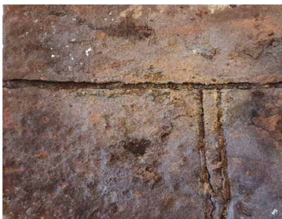
Fig. 2. DN 800 water pipeline – corroded section of the longitudinal seam and butt circumferential weld above

Failures of pipelines for transporting technological water and pipelines for transporting post-flotation waste were analyzed. The distinguished types of pipelines are characterized by different properties, despite the use of the same materials. Pipelines for transporting water are not subject to intense abrasive wear. The most important cause of failure is corrosion, especially local corrosion of longitudinal seams. These pipelines are covered from the inside with a dense, absorbent, permeable layer of corrosion products. It is extremely difficult to diagnose their condition due to the precipitation and deposition of sediments, the lack of free access and the required availability. Figure 2 shows the corroded section of the longitudinal seam and the circumferential weld connecting the DN 800 water pipelines.