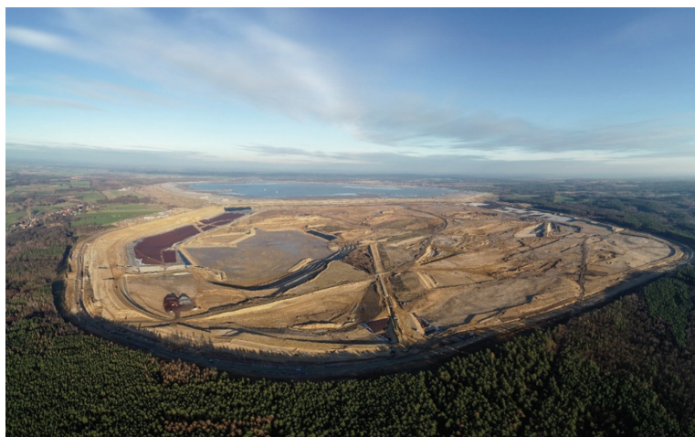
Fig. 1. The Żelazny Most tailings storage facility (OUOW) with the South Headquaters under construction – the main building of the Hydrotechnical Department

Figure 1 shows the Żelazny Most tailings storage facility (OUOW) with the South Quarter which is currently under construction.