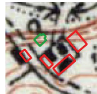
map from 1937 with building data from 2020