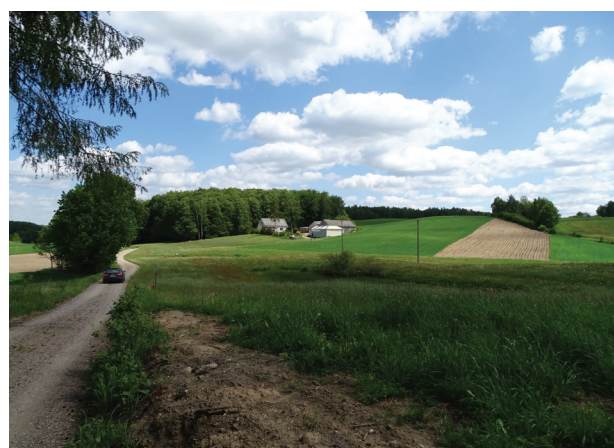
Fig. 1. An isolated farmstead in Kashubia

The study was conducted on the border of three communes in the Pomeranian Voivodeship, i.e., the communes of Somonino, Nowa Karczma and Przywidz. The research area centres around Pojezierze Kaszubskie [the Kashubian Lake District], whose landscape is characterised by young glacial relief with numerous hills, ravines, lakes and post-glacier depressions. The region is very attractive in terms of the views it offers, which stems from the diverse terrain and picturesque, small settlements against a background of forests or meadows and greenery-covered fields. Often, scattered farmsteads or hamlets are characterised by an outstanding landscape exposure. Due to the attractiveness of the landscape, the proximity of a large urban centre and the availability of construction land, this area has become a site of expansion of single-family residential and tourist construction. The study is focused on the development of old isolated farmsteads (Fig. 1). In the conditions of energy