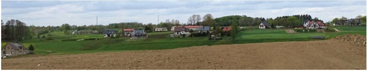
Fig. 6. Panorama of Połęczyn

II. 6. Panorama Połęczyna