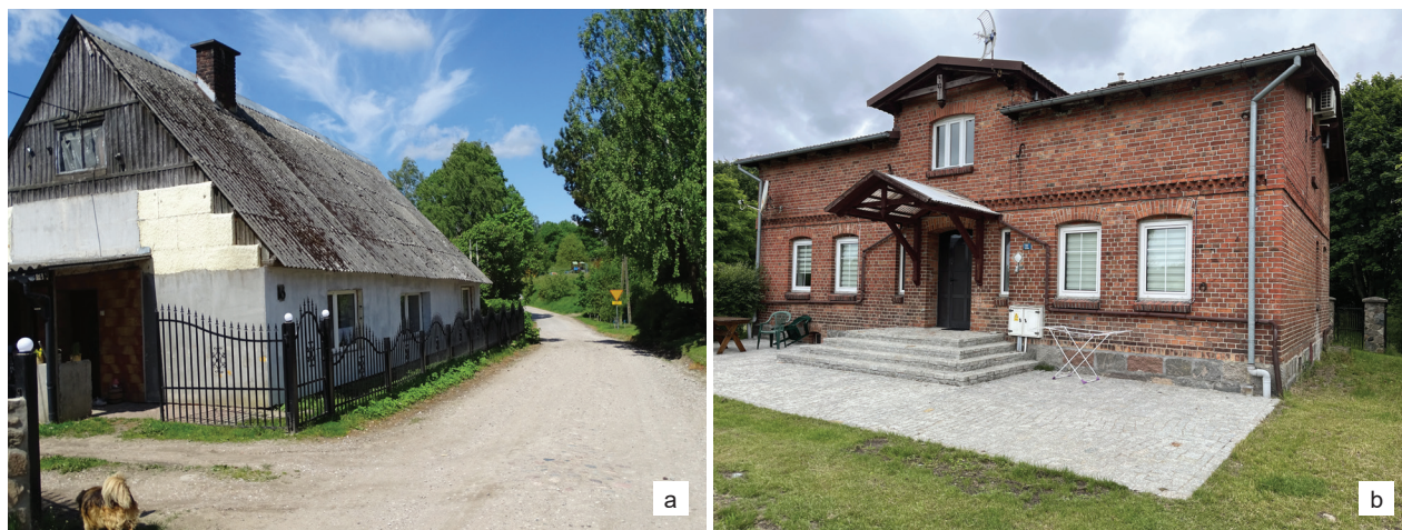
Fig. 2. Two types of farmstead houses in Kashubia: a) a building with a high roof, b) a building with a semi-flat roof

Il. 2. Dwa typy domów zagrodowych na Kaszubach: a) budynek z dachem wysokim, b) budynek z dachem półpłaskim