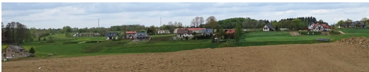
Fig. 6. Panorama of Połęczyn

Il. 6. Panorama Połęczyna