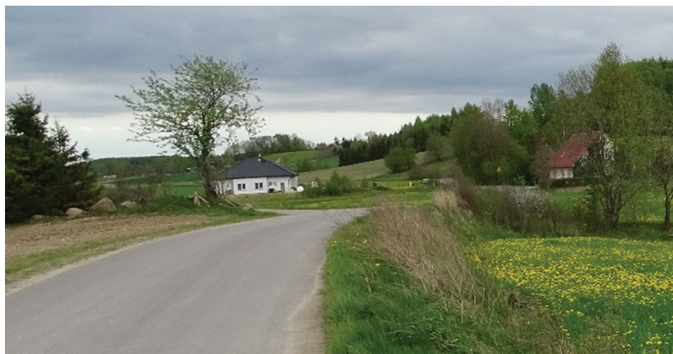
Fig. 5. New building closing the scenic corridor

The number of buildings in historic farmsteads not always resulted from the wealth of the farm, which is usually assumed for simplification based on model farm projects developed for the reconstruction of villages in independent Poland [16]. In the studied area, both small multi-building farmsteads and two-building layouts of