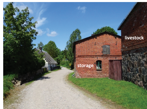
Fig. 4. An example of a farmstead inventory card (elaborated by A. Górka)

Il. 4. Przykładowa karta inwentaryzacyjna zagrody (oprac. A. Górka)