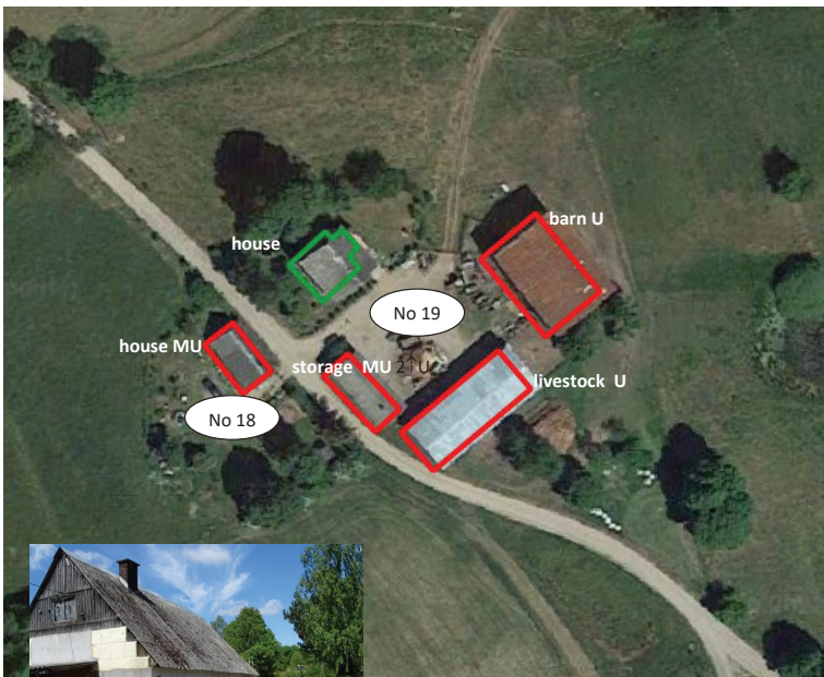
orthophotomap and building data from 2020