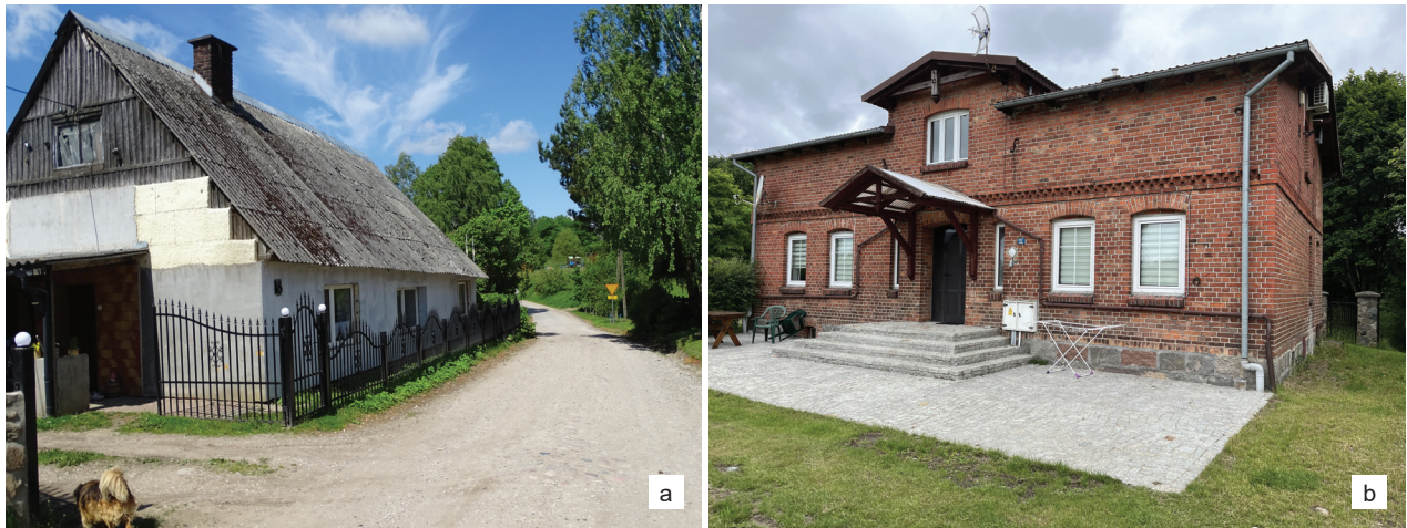
Fig. 2. Two types of farmstead houses in Kashubia: a) a building with a high roof, b) a building with a semi-flat roof

Il. 2. Dwa typy domów zagrodowych na Kaszubach: a) budynek z dachem wysokim, b) budynek z dachem półpłaskim