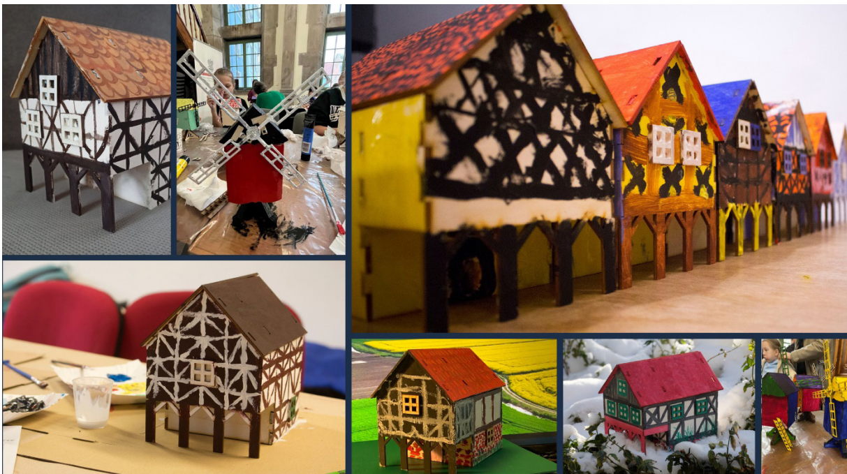
Fig. 4. Final results of the workshops.