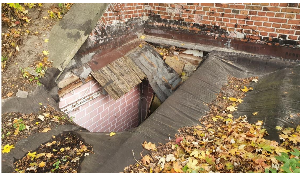
Fig. 15. Moisture damage to ceramic masonry as a result of water flooding caused by the collapse of a moisture-damaged and biologically corroded wood-framed roof: a) view, b) close-up