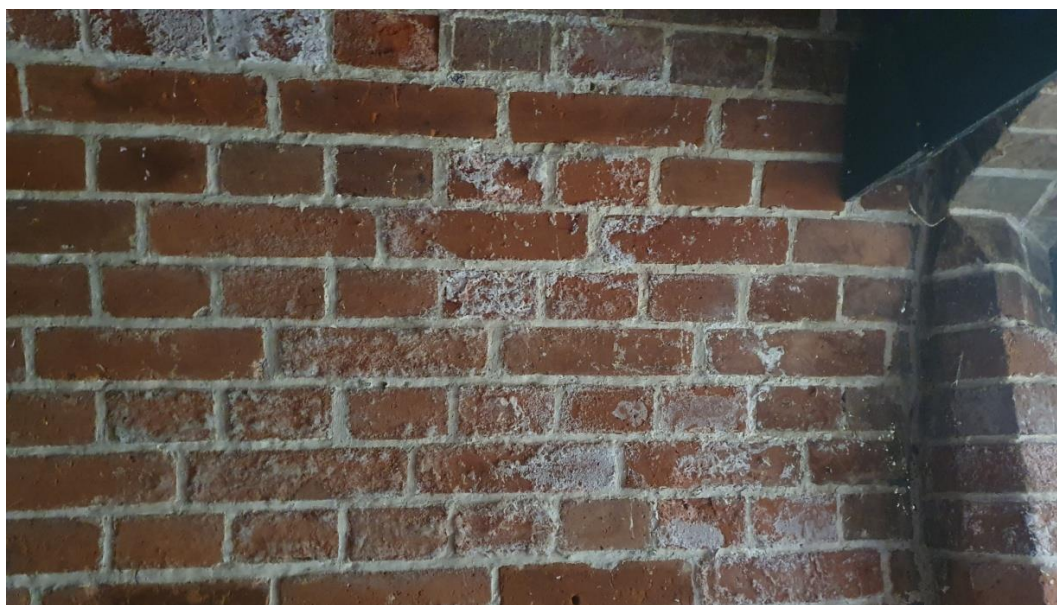
Fig. 4. Development of biological corrosion on the interior surface of the exterior solid ceramic brick masonry, visible cement mortar tight joint improperly executed in the past period during renovation work

Active bacterial and fungal activity can be recognized not only by the appearance of mold and plaques on structural parts, but also by the characteristic odor.