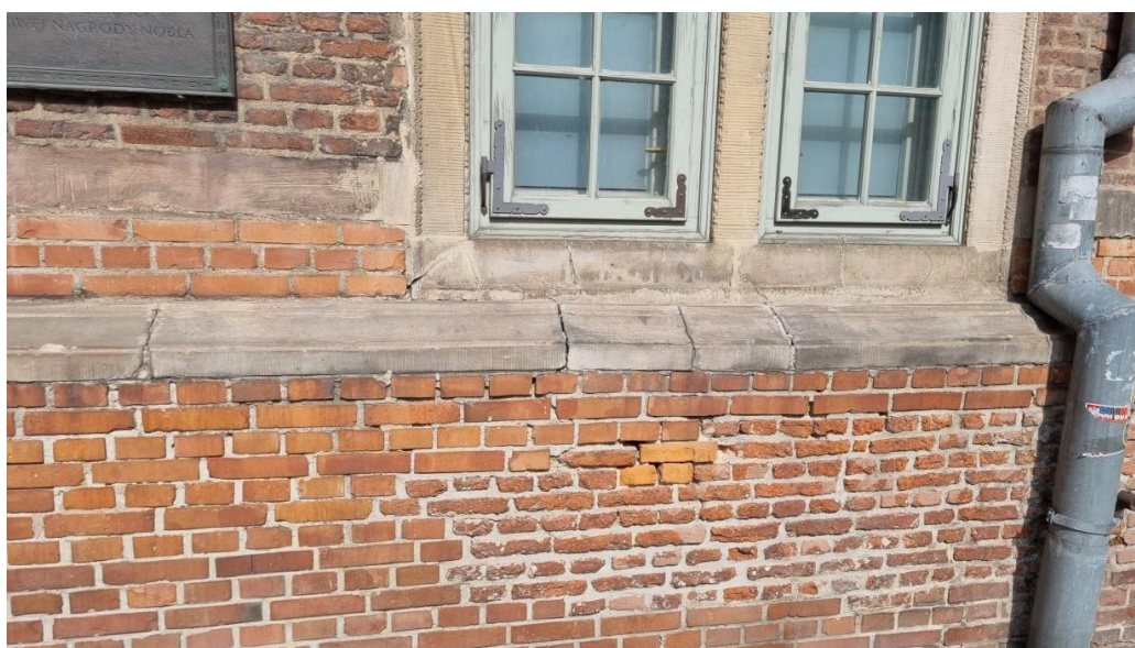
Fig. 9. "Hollow joints" of the exterior masonry of solid ceramic brick, additionally visible frost damage and weathering of the wall