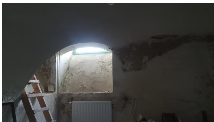
Fig. 7. Dampness of the external wall made of solid ceramic brick caused by the lack of vertical damp proofing in the part sunk in the ground

In the case of historic buildings from a bygone period, especially with regard to medieval and Gothic religious buildings, it should be remembered that their implementation was based on the professional experience of the builders of the time [25], [26]. Design documentation was simplified, or reduced to a drawing (painting) which, using modern terminology, corresponded to a conceptual design. The solutions adopted and directed for implementation were not supported by detailed static-strength calculations: this also applies to the construction of brick masonry and brick vaults, commonly used in religious buildings. However, taking into account the time realities inherent in the period of implementation of this type of buildings, it can be assumed that the main design errors and shortcomings include: