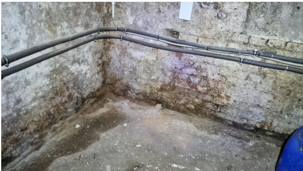
Fig. 8. Dampness of the external masonry of solid ceramic brick caused by the lack of horizontal damp proofing in the part sunk in the ground and the lack of technical efficiency (leakage) of the vertical damp proofing membrane