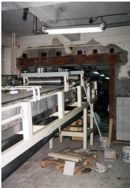
Fig. 18. Widening of the door opening in the inner wall of solid ceramic brick – view of the steel frame construction