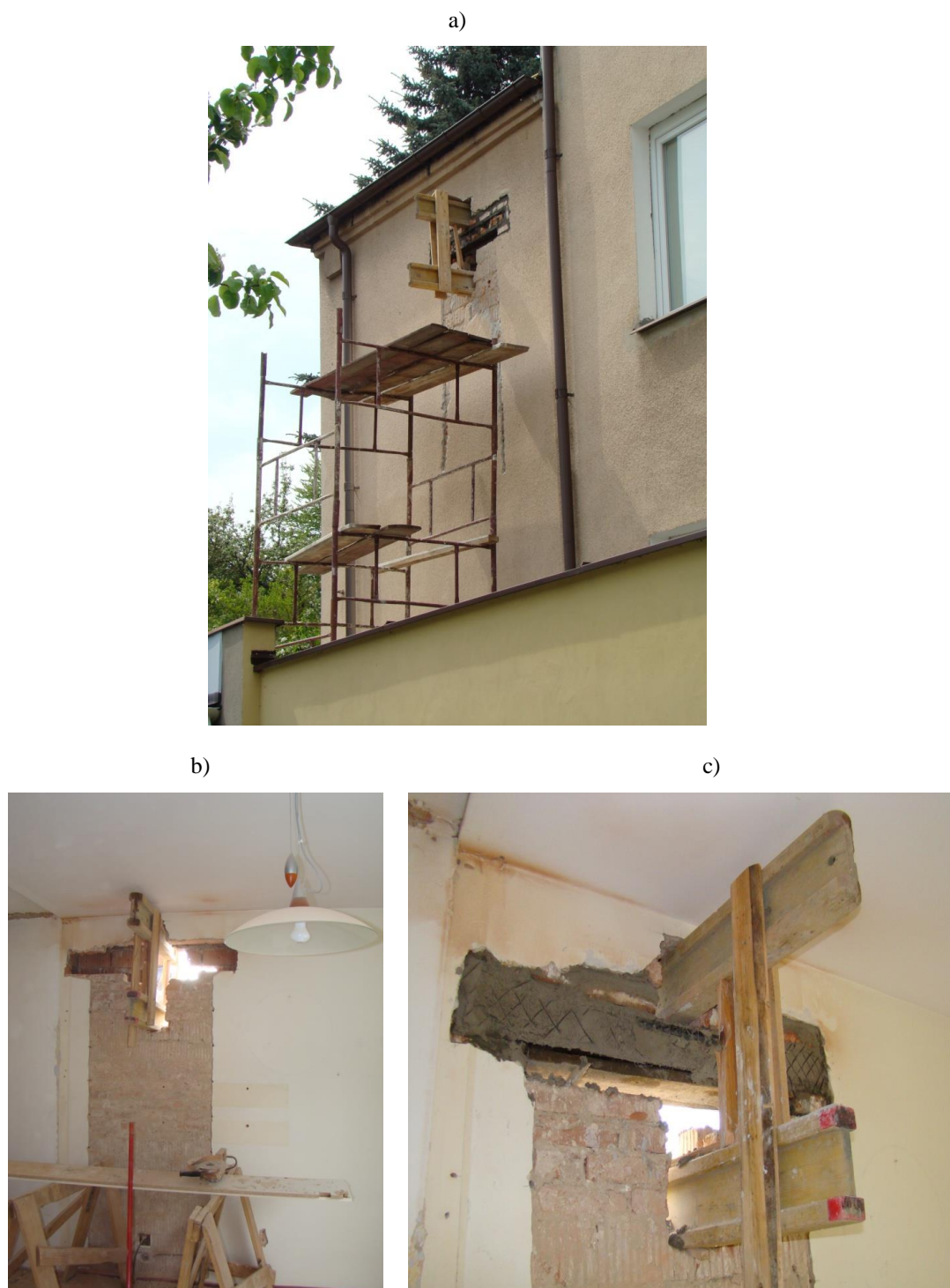
Fig. 16. Realization of the door opening in the layered external wall made of ceramic lattice bricks – stages of realization in the view from: a) exterior, b), c) interior